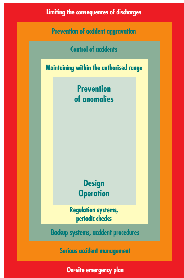
The five levels in “Defence in Depth”

The design of nuclear installations is based on a defence in depth approach. Five levels of protection are defined for nuclear reactors: