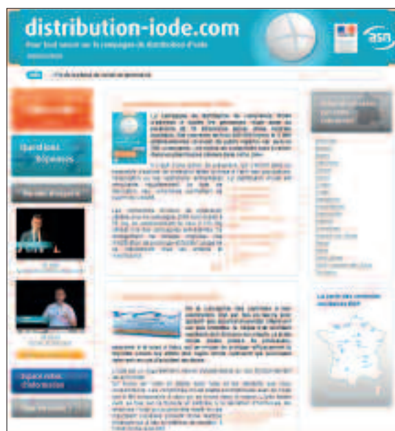
Website dedicated to the 2009 iodine tablet distribution campaign, www.distribution-iode.com

In 2009, ASN continued its meetings with foreign organisations in charge of emergency situation management. ASN in particular met the NRC in the United States and was able to observe an emergency exercise in April 2009. On the basis of this experience, ASN submitted proposals for improvements to its own organisation, aimed at improving the decision-making and information exchange processes, in particular by deploying collaborative IT tools.