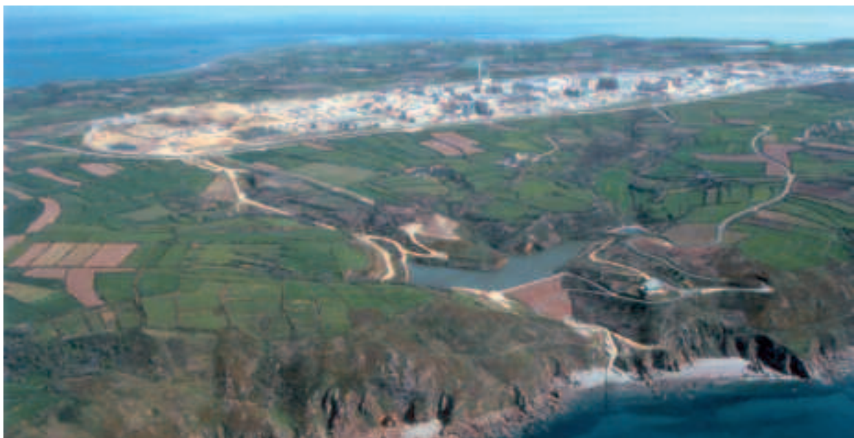
Aerial view of the La Hague site (Manche département)

In 2009, the fuel cycle installations experienced a number of incidents reflecting weaknesses in the safety and radiation protection organisation of the AREVA group's installations. ASN hopes to see greater rigour in compliance with the notification criteria and the time taken to forward the reports of these events, as well as greater focus on the measures to be taken to prevent them happening again.