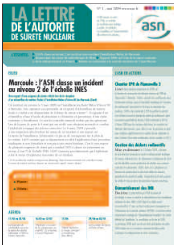
Nuclear Safety Authority newsletter no. 1

2009. The final conformity work will take place in 2010. This in particular entailed adjustment of the composition of the CLIs according to the new rules, drafting of internal regulations and implementation of the new operating requirements. Four new CLIs were created in 2009. At the end of 2009, only three BNIs were still without a CLI. Subsequent to these changes, there will be about thirty-five CLIs covered by the TSN Act.