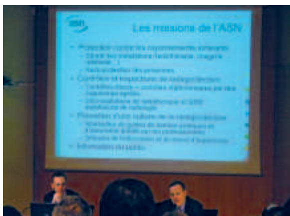
Talk by Mr Bourguignon, ASN Commissioner (right) during the meeting with the profession on the subject of radiotherapy safety in Marseilles – February 2009

significant level of exposure. The presence of radionuclides used in nuclear medicine may occasionally be detected in major rivers or in city sewage treatment plants. The associated doses are evaluated at a few microSieverts for the individuals most heavily exposed.