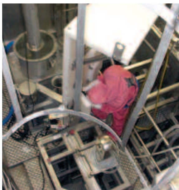
The HAO facility at La Hague during decommissioning in 2007 (Manche département)

With regard to decommissioning of CEA installations, ASN considers that it is on the whole proceeding satisfactorily. The year was mainly marked by the incident in the ATPu, during which the quantities of plutonium placed in the glove boxes during operation of the installation had been underestimated. Owing to the shortcomings observed in the management of