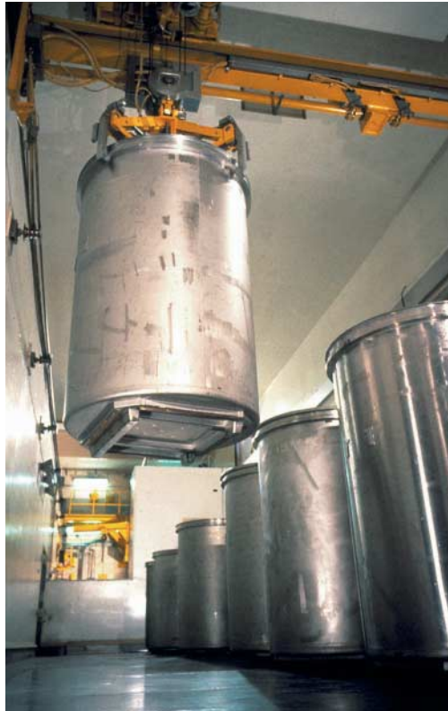
Handling of casks containing cemented hulls and end-pieces in the storage hall at COGEMA's UP3 plant in La Hague

This bill should not address only high-level long-lived waste. In accordance with the OPECST recommendation of March 2005, the