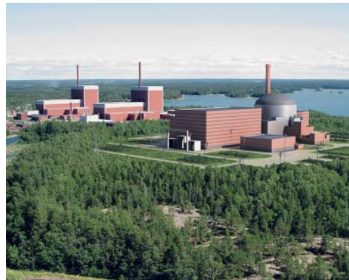
Olkiluoto nuclear site in Finland. Background: existing reactors. Foreground: simulated image of the EPR reactor

-submit for examination by the ASN a preliminary safety analysis report (RPS) encompassing description of the site and the operations that will be carried out there, inventory of the risks that it presents, regardless of the source thereof, analysis of the provisions made to prevent such risks and