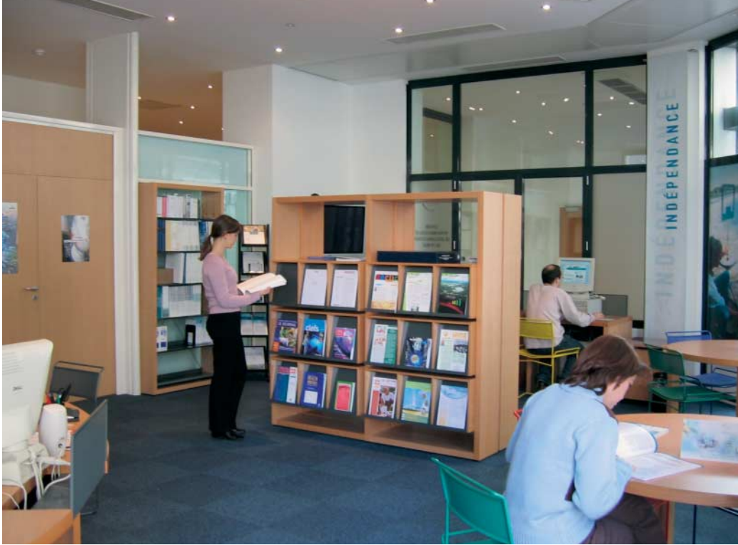
Information and documentation center of ASN at 6, place du Colonel Bourgoïn à Paris 12e

the general public and a sample called “informed public” made up in particular of journalists, elected representatives, heads of associations, administrative heads, CLI chairpersons, healthcare professionals and teachers representing an informed public. It emerges that, although a large majority of interviewees were aware of the existence of a control organisation, few were able to cite the ASN spontaneously or recognize its name (16% of those interviewed in the general public sector).