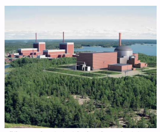
Olkiluoto nuclear site in Finland. Background: existing reactors. Foreground: simulated image of the EPR reactor

-submit for examination by the ASN a preliminary safety analysis report (RPS) encompassing description of the site and the operations that will be carried out there, inventory of the risks that it presents, regardless of the source thereof, analysis of the provisions made to prevent such risks and