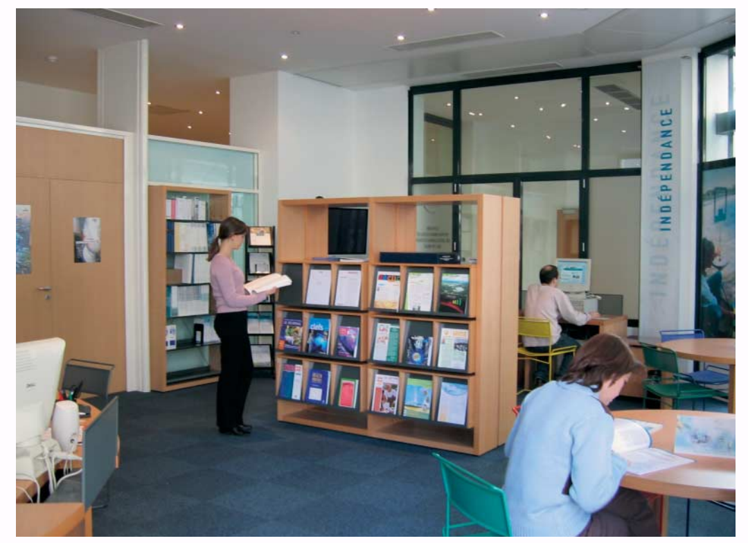
Information and documentation center of ASN at 6, place du Colonel Bourgoin à Paris 12e

the general public and a sample called "informed public" made up in particular of journalists, elected representatives, heads of associations, administrative heads, CLI chairpersons, healthcare professionals and teachers representing an informed public. It emerges that, although a large majority of interviewees were aware of the existence of a control organisation, few were able to cite the ASN spontaneously or recognize its name (16% of those interviewed in the general public sector).