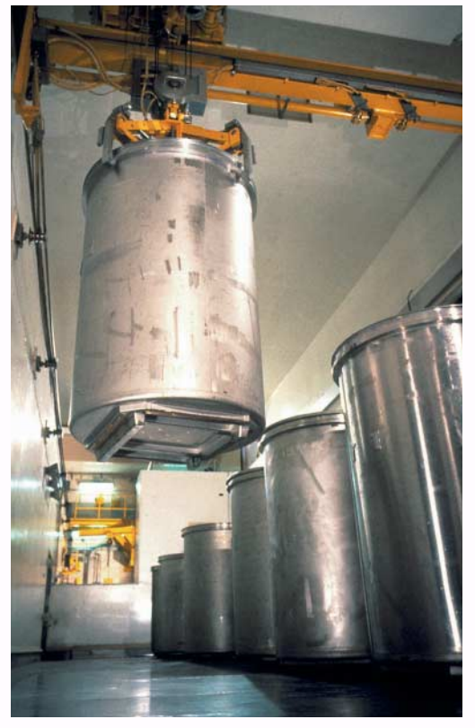
Handling of casks containing cemented hulls and endpieces in the storage hall at COGEMA's UP3 plant in La Hague

This bill should not address only high-level long-lived waste. In accordance with the OPECST recommendation of March 2005, the