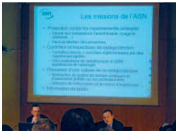
Talk by Mr Bourguignon, ASN Commissioner (right) during the meeting with the profession on the subject of radiotherapy safety in Marseilles – February 2009

significant level of exposure. The presence of radionuclides used in nuclear medicine may occasionally be detected in major rivers or in city sewage treatment plants. The associated doses are evaluated at a few microSieverts for the individuals most heavily exposed.