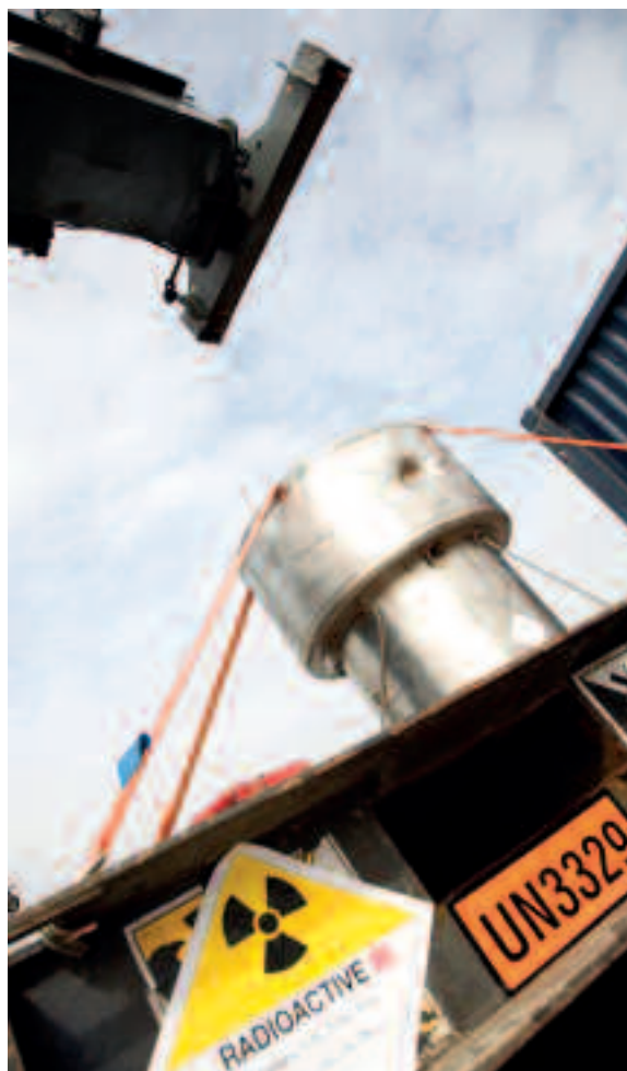
National emergency exercise simulating a radioactive materials transport accident in Nantes – October 2007

In 2009, ASN issued 65 package model certificates, defining their manufacturing, operating and maintenance conditions.