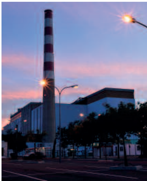
The CEA PHÉNIX reactor in Marcoule (Gard département)

The PHÉNIX reactor , which was commissioned in 1973, was finally shut down on 6 March 2009. The rest of 2009 was devoted to performance of “end of life” tests. These tests are designed to provide additional data on sodium-cooled fast neutron reactor technology, with a view to the development of “generation IV” power generating reactor technology. The reactor decommissioning licence application should be sent to ASN in 2010.