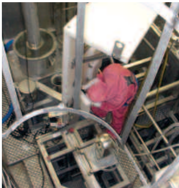
The HAO facility at La Hague during decommissioning in 2007 (Manche département)

With regard to decommissioning of CEA installations, ASN considers that it is on the whole proceeding satisfactorily. The year was mainly marked by the incident in the ATPu, during which the quantities of plutonium placed in the glove boxes during operation of the installation had been underestimated. Owing to the shortcomings observed in the management of