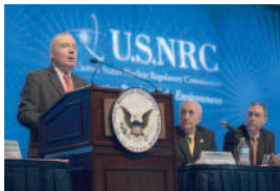
Talk by the ASN Chairman at the plenary opening session of the Regulatory Information Conference on 10 March 2009 in Washington (USA)

In 2008, ENSREG (European Nuclear Safety Regulators’ Group, previously known as the High Level Group (HLG)), was created as a forum for the heads of the European Union’s safety regulators, at the request of the European Council meeting in March 2007. It began reviewing safety, waste and spent fuel management and transparency in the nuclear sector in Europe as a whole. This work found ready support from the French presidency of the European Union (second half of 2008), during which the initial debates on a nuclear safety directive were held. This directive, finally adopted on 25 June 2009, constitutes a binding EU framework for