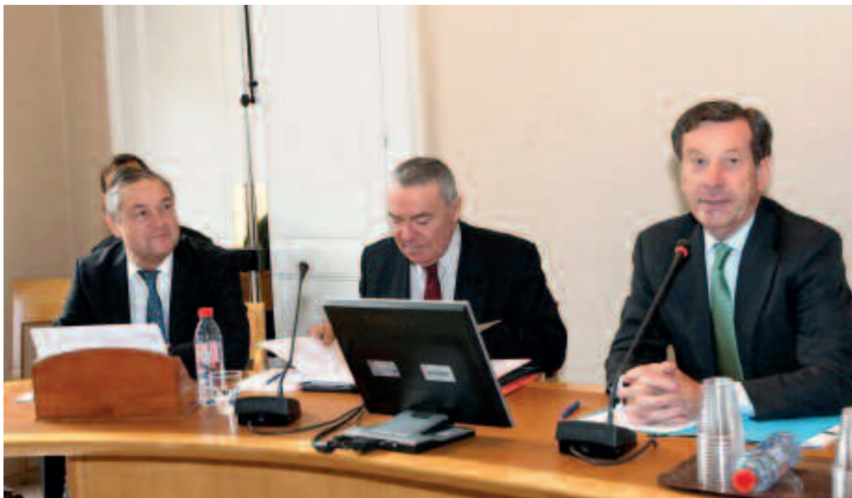
ASN hearing before the Economy, Sustainable Development and Spatial Planning Commission, concerning the ASN review of the EPR reactor I&C system – November 2009

ASN is run by a Commission of five full-time commissioners who cannot be removed from office and who are appointed for a 6-year non-renewable mandate by the President of the Republic, the President of the Senate and the President of the National Assembly. ASN comprises its headquarters and eleven regional divisions spread around the country.