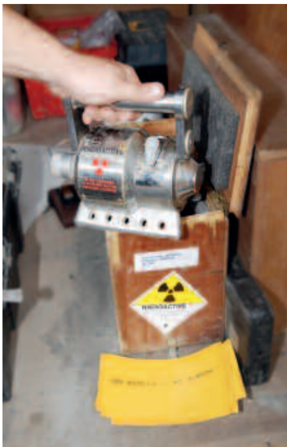
Gamma radiography appliance and its transport case

“ ... Because of the equipment used and the intervention conditions, ASN sees industrial radiology as an activity with high stakes in terms of radiation protection and sees it as a priority. ASN considers that the extent to which companies take account of the risk of worker exposure to ionising radiations varies widely and that there is still room for improvement, in particular through improved coordination between clients and contractors in preparing the work and in allowing effective preventive measures to be taken ”