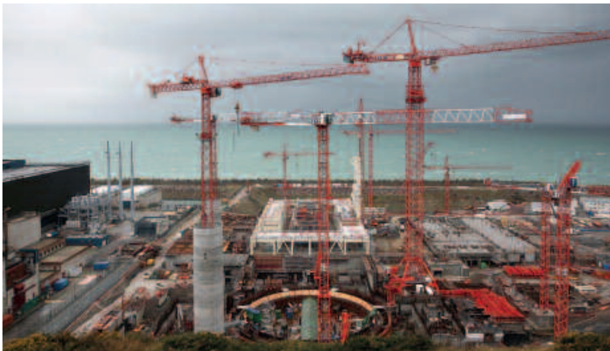
General view of the future EPR Flamanville 3 reactor (Manche département) – January 2009

of British and American inspectors to ASN and French inspectors to HSE and NRC. ASN is also playing an active role in the Multinational Design Evaluation Program (MDEP) for new reactors. Four meetings to discuss the EPR reactor have been held as part of this program. Multinational cooperation within the MDEP led in 2009 to the HSE, STUK and ASN reaching consistent positions on the safety of the I&C system. A common stance could also be taken on other subjects, thereby guaranteeing the robustness of the safety reviews conducted.