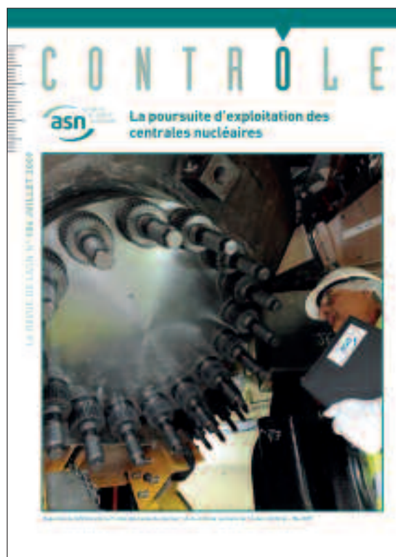
Contrôle review issue dealing with the continued operation of nuclear power plants, July 2009 issue

Inspection of the nuclear power plants in operation will remain a priority. ASN considers that maintaining the reactors in good condition will require that EDF continue with its maintenance efforts. The significant extension of the outage times of some reactors in 2009 reflects the scale of the maintenance operations necessary when equipment deterioration