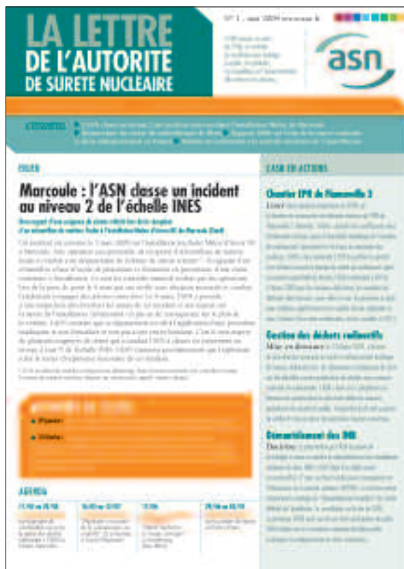
Nuclear Safety Authority newsletter no. 1

2009. The final conformity work will take place in 2010. This in particular entailed adjustment of the composition of the CLIs according to the new rules, drafting of internal regulations and implementation of the new operating requirements. Four new CLIs were created in 2009. At the end of 2009, only three BNIs were still without a CLI. Subsequent to these changes, there will be about thirty-five CLIs covered by the TSN Act.