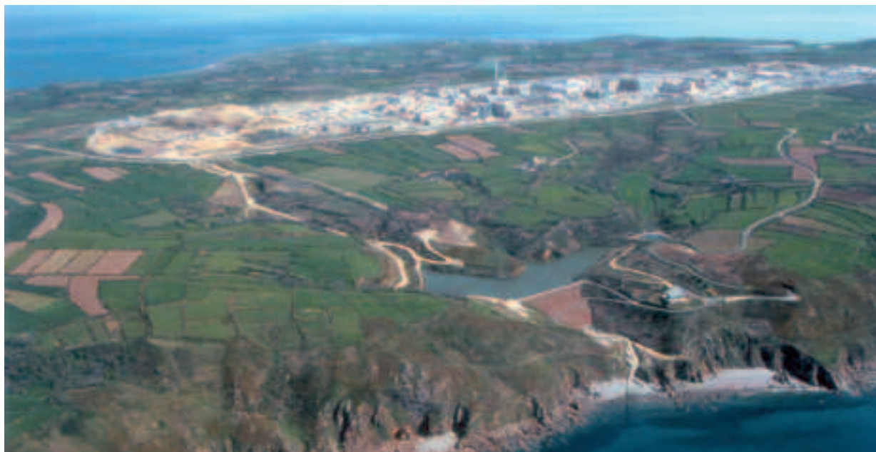
Aerial view of the La Hague site (Manche département)

In 2009, the fuel cycle installations experienced a number of incidents reflecting weaknesses in the safety and radiation protection organisation of the AREVA group's installations. ASN hopes to see greater rigour in compliance with the notification criteria and the time taken to forward the reports of these events, as well as greater focus on the measures to be taken to prevent them happening again.