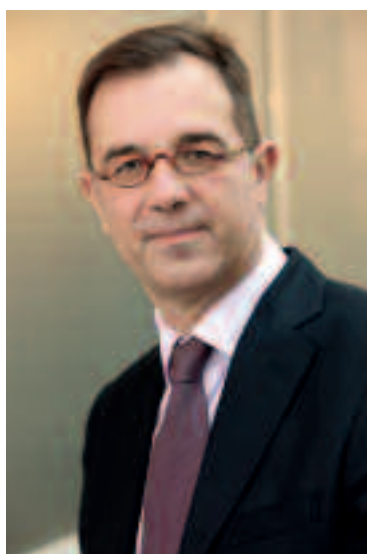
Jean-Christophe NIEL ASN Director-General

distribution to populations living near nuclear power plants, and so on. ASN organised the international conference on the safety of radiotherapy treatments in Versailles in December 2009, and prepared the launch of the www.mesure-radioactivite.fr website for the French National Network of Environmental Radioactivity Monitoring (RNMRE). In 2009, ASN also organised national seminars, in particular concerning radiation protection, with the main nuclear licensees and small-scale nuclear operators (nuclear medicine, industrial radiography, etc.).